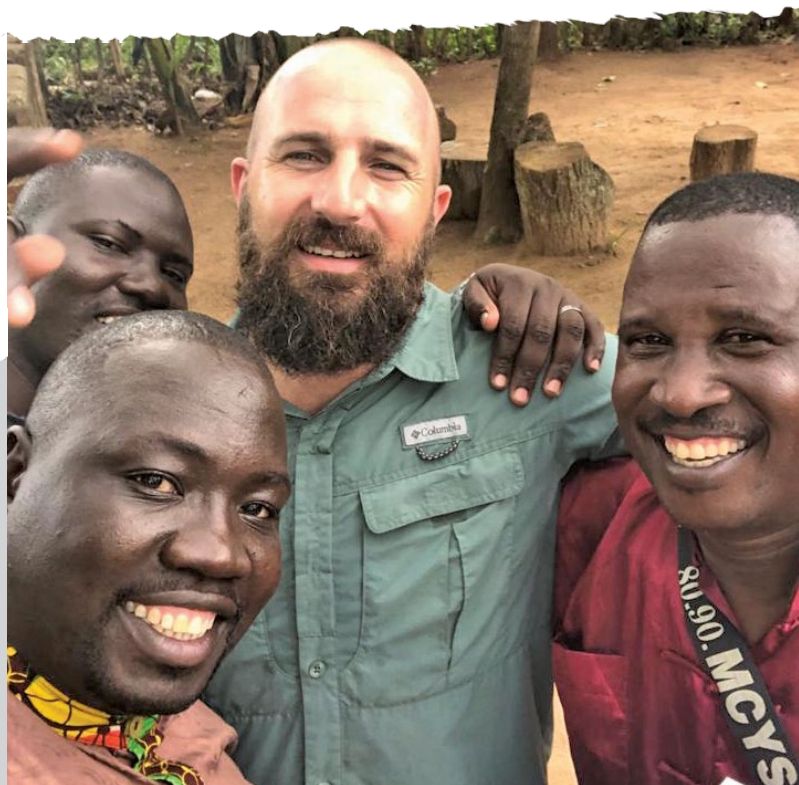
Thanks to faithful supporters like you, pastors are being trained all around the globe.