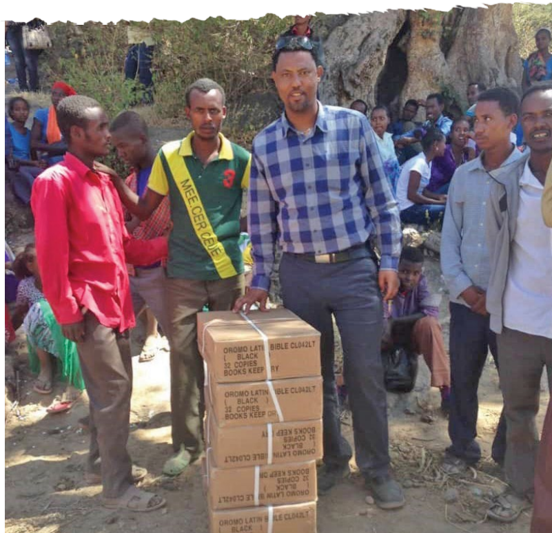
Thanks to faithful supporters like you, Oromo Bibles could be delivered to churches in Ethiopia.

Your gift has the ability to save lives and to lead the lost to Christ. Your gift has eternal value. ✉