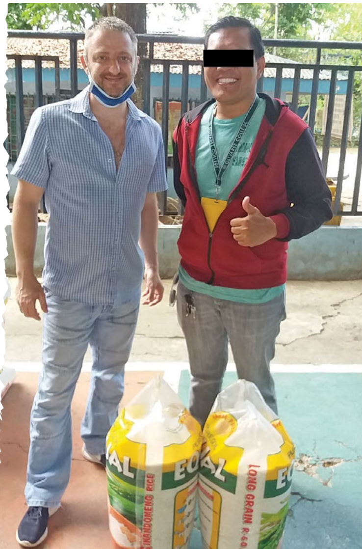
Thanks to faithful supporters like you, pastors who received food aid could share their food and reach out to unbelievers in their areas.