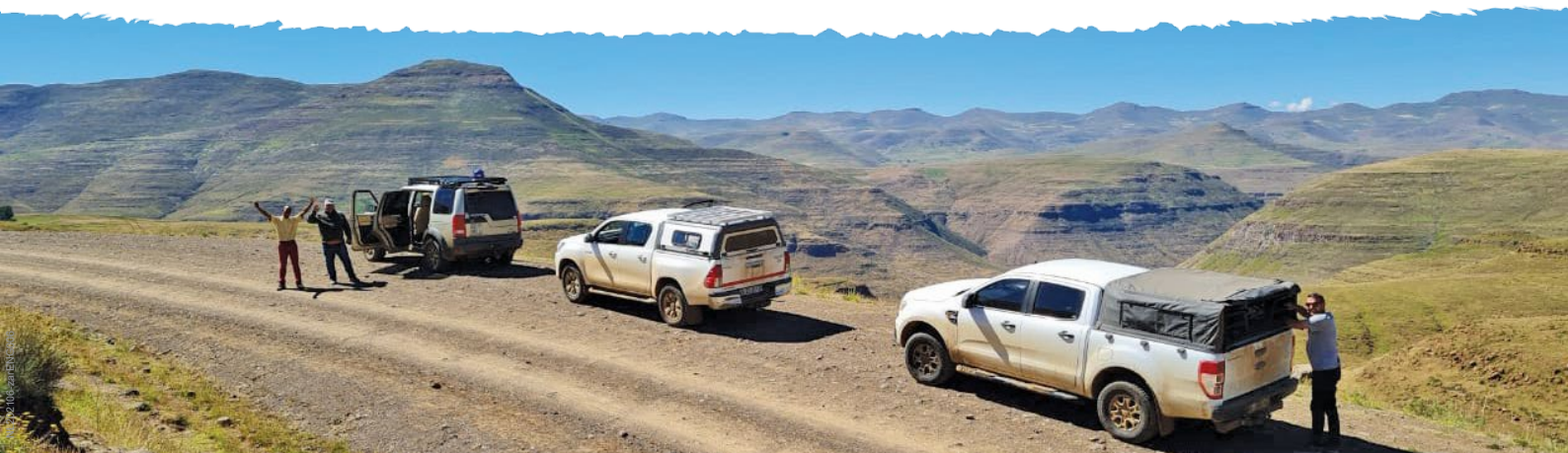
When you partner with Harvesters, you are opening the way for the unreached to know Jesus. Recently, you also helped to deliver Bibles to church members in the mountainous Lesotho. Thank you for your gifts and prayers!

Thanks to your donations this Bible placement has changed the lives of over a thousand believers in Lesotho. It costs R300 to put a native-language Bible into the hands of our Harvesters brothers and sisters. Prayerfully consider giving an invaluable gift of a Bible today. 📖