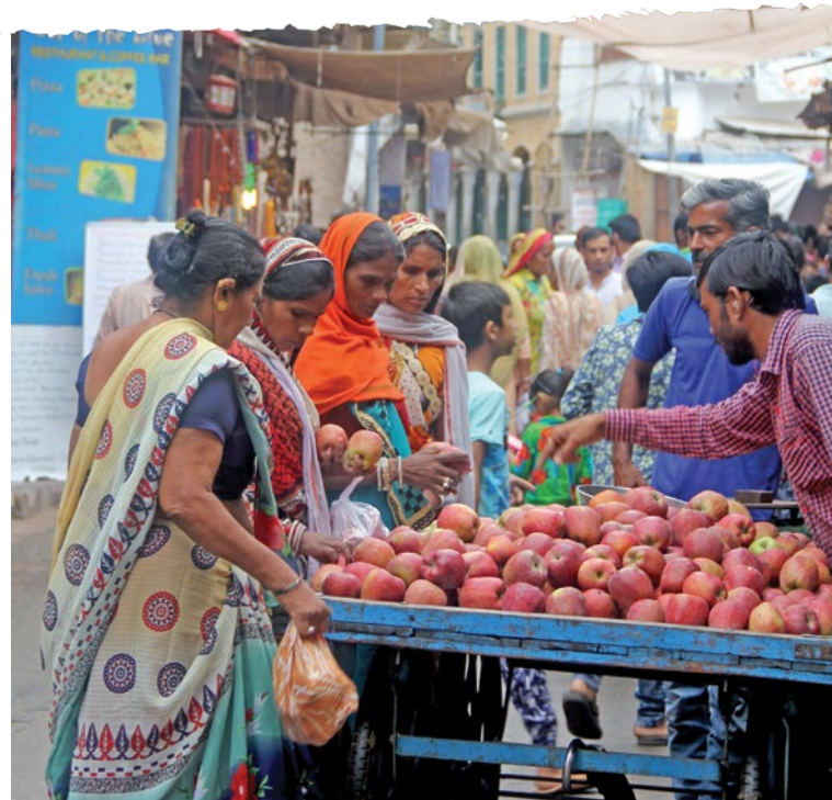
When you partner with Harvesters, you're opening the way for the unreached to know Jesus. Thank you for your gifts and prayers!