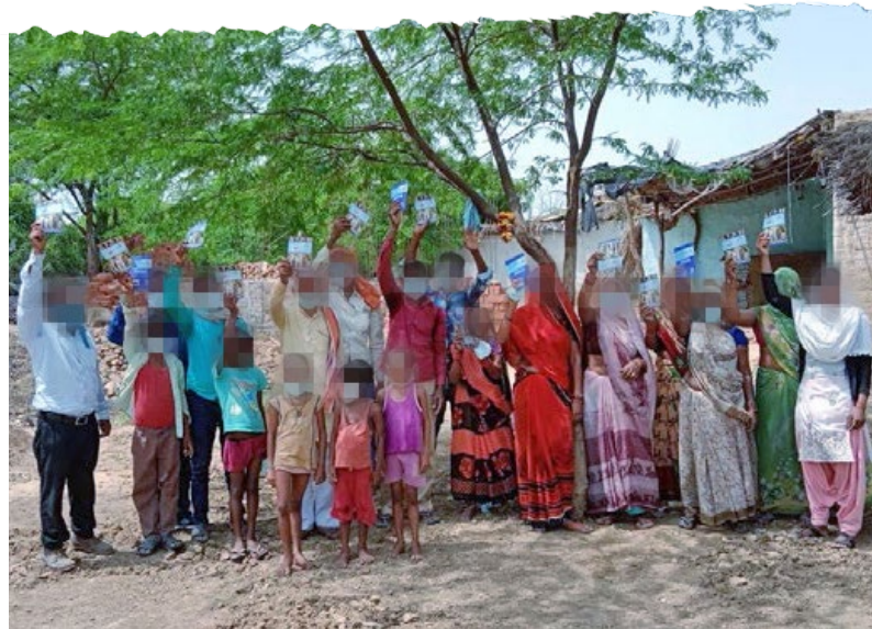
During the pandemic, Indian pastors have come up with creative ways to still meet as a church, like gathering at the community borehole – sharing about Jesus who is the living water – or having church services under a tree in the village.