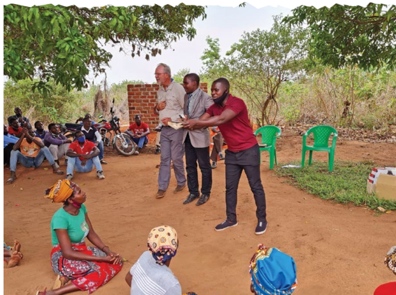
Bibles, Trans World Radios and training were provided. Also a fun Living Ball decorated with the Gospel and a 'Reach for Life' youth Bible – packed full of extra resources and lessons inside its pages – were handed out to the youth.