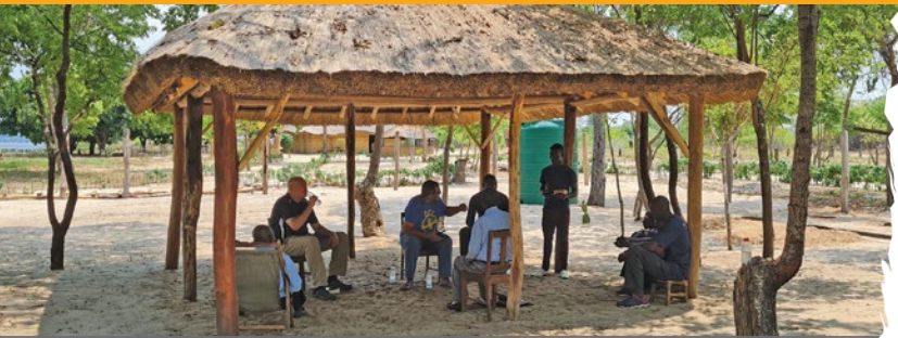
Training under a shelter.