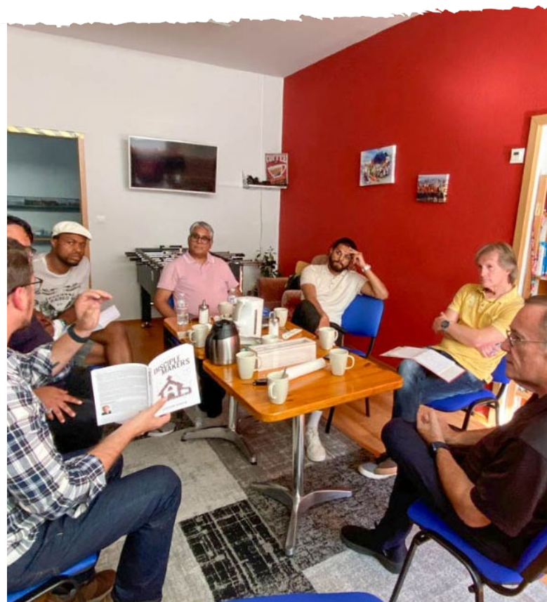
Envisioning meeting in the Netherlands.