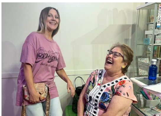
Training in Spain