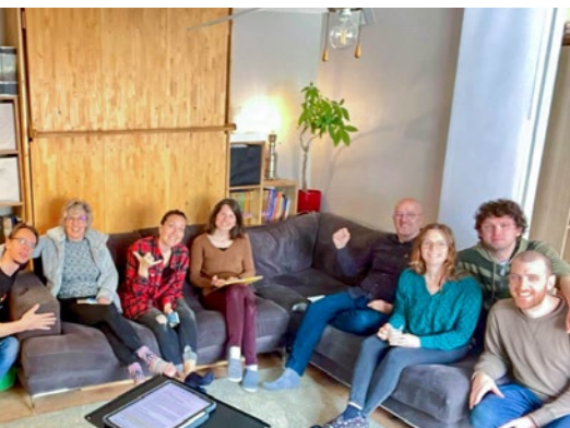
A home church in France

After 25 years of planting churches and training pastors in Africa, Asia and South America, Harvesters is now extending that experience to the Western world. The biblical